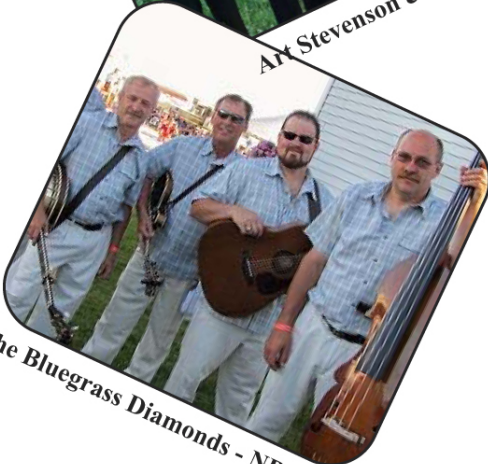
The Bluegrass Diamonds - NB